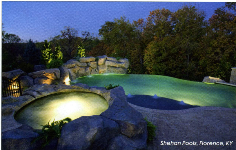
Shehan Pools, Florence, KY

Water features are versatile, too. If your land-