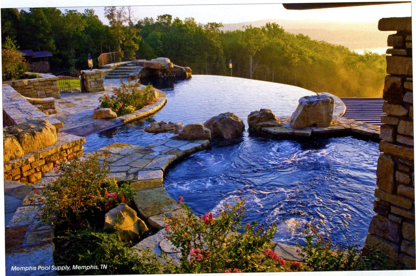
Memphis Pool Supply, Memphis, TN