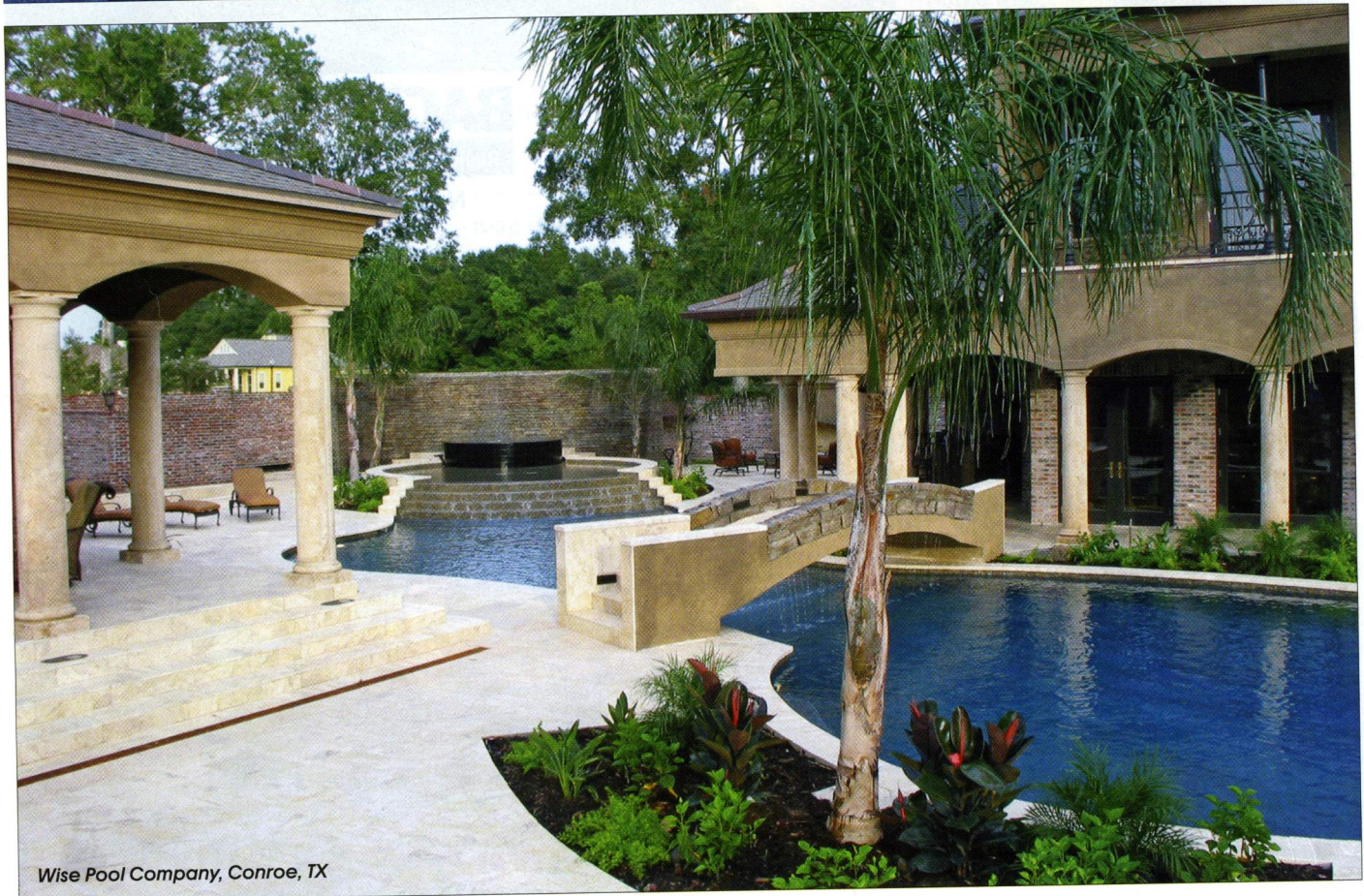
Wise Pool Company, Conroe, TX