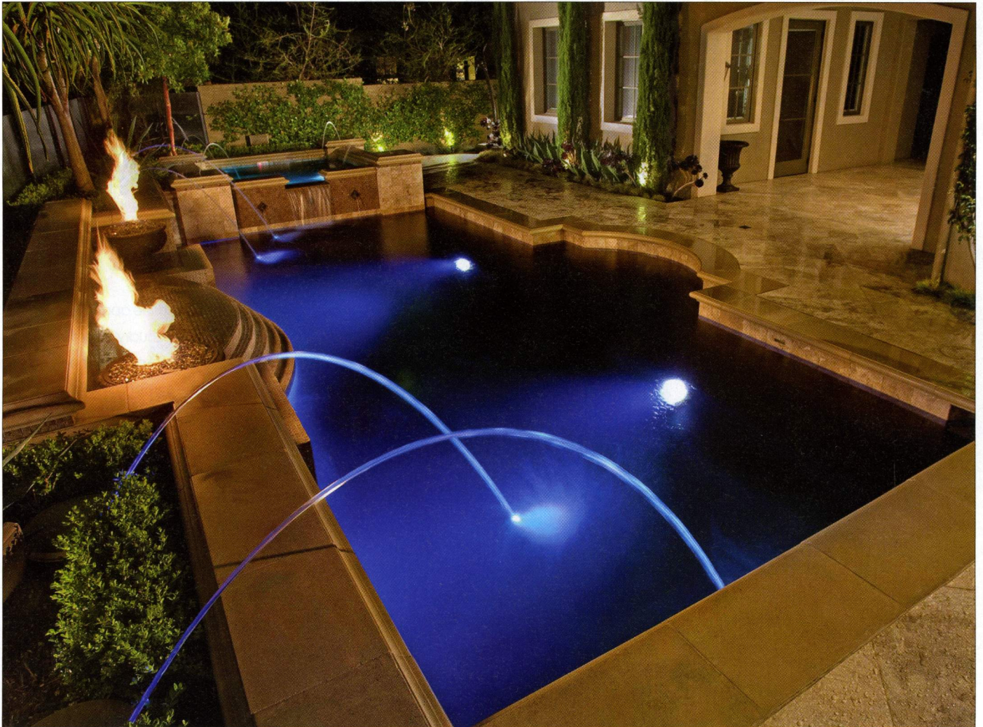
Alderete Pools, San Clemente, CA

The easy solution for summer entertaining