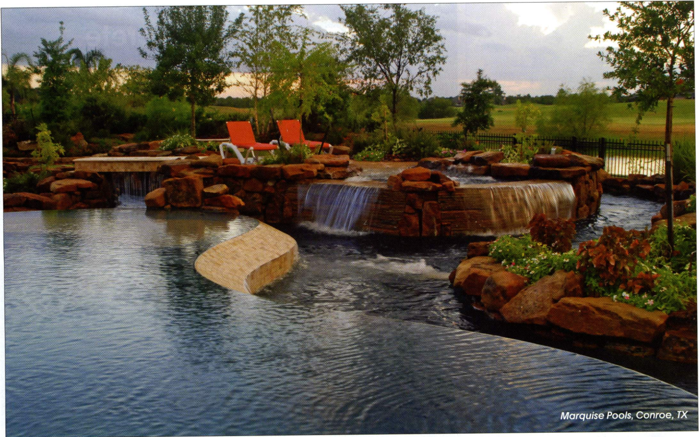
Marquise Pools, Conroe, TX

Fiberglass pools, on the other hand, are one-piece and are built in a factory, which makes them a popular choice among many homeowners because of their shorter build time. Gunite pools are usually more expensive, but they're well worth the added expense because they lend themselves beautifully to the